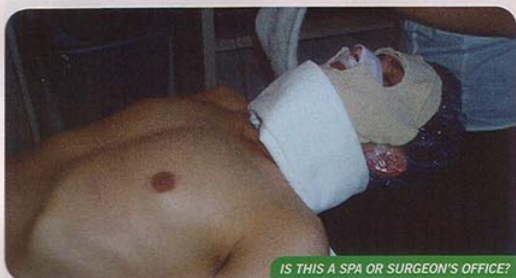
IS THIS A SPA OR SURGEON'S OFFICE?