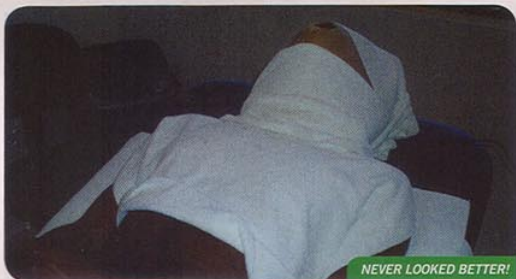
NEVER LOOKED BETTER!

Did you see a noticeable difference post facial?